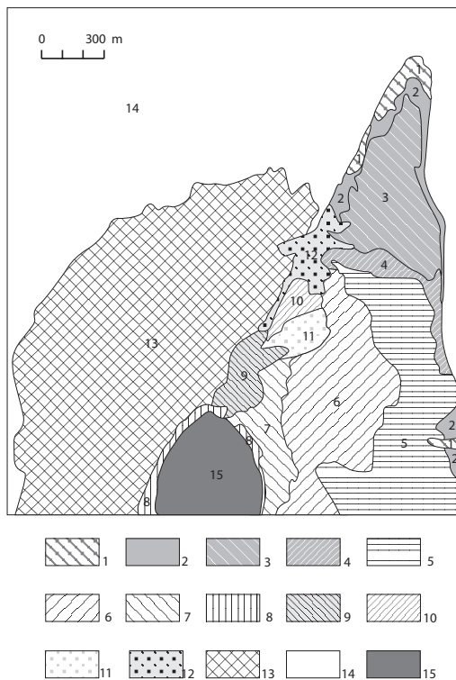
Fig. 2. Vegetation map of the Kudrovsky mire massif based on dominant approach. The legend captions: 1) Chamaedaphne calyculata-Sphagnum angustifolium+S. magellanicum ; 2) Pinus sylvestris f. Litwinowii-Eriophorum vaginatum-Sphagnum angustifolium ; 3) Eriophorum vaginatum-Sphagnum magellanicum ; 4) Eriophorum vaginatum-Sphagnum angustifolium (Bogdanowskaya-Guiheneuf 1928); 5) Hummock-hollow complex: Eriophorum vaginatum-Sphagnum fuscum, Scheuchzeria palustris-Sphagnum balticum ; 6) Pinus sylvestris f. Litwinowii-Ericaceae-Sphagnum ssp. (Bogdanowskaya-Guiheneuf 1928); 7) Calluna vulgaris-Sphagnum fuscum ; 8) Pinus sylvestris f. uliginosa-Vaccinium ssp.-Sphagnum angustifolium (Bogdanowskaya-Guiheneuf 1928); 9) Calluna vulgaris-Sphagnum angustifolium (Bogdanowskaya-Guiheneuf 1928); 10) Pinus sylvestris-Calluna vulgaris-Polytrichum strictum ; 11) Calluna vulgaris-Polytrichum strictum ; 12) Pinus sylvestris f. uliginosa-Ledum palustre-Sphagnum magellanicum+S. angustifolium ; 13) non-studied area; 14) spruce and mixed southern taiga forests; 15) lake Kuznetsovskoe

Kuva 2. Kudrovskin suoalueen kasvillisuuskartta perustuen ekologis-fytokenoottiseen kasvillisuusluokitukseen.